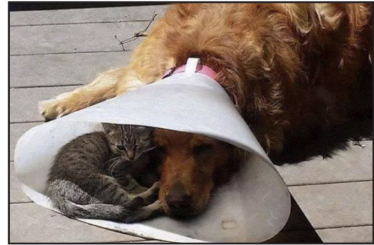
Don't worry buddy, I'm with you...