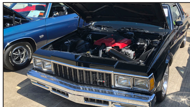
Jim Crossland 1979 Caprice