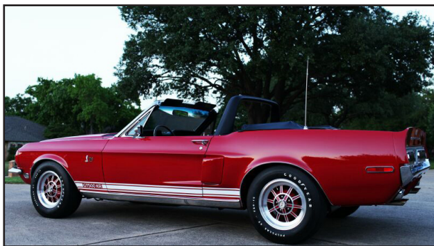
1968 Shelby GT500 - won Best Shelby, a prestigious Ford Southern Regional Show award