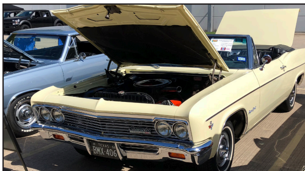
Ed Baker 1966 Impala SS convertible

Also toured Sam Pack's incredible car museum, quite impressive to say the least.