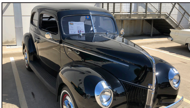
Dan Gill 1940 Ford coupe