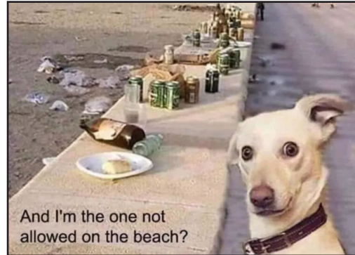
And I'm the one not allowed on the beach?