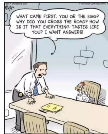
WHAT CAME FIRST, YOU OR THE EGG? WHY DID YOU CROSS THE ROAD? HOW IS IT THAT EVERYTHING TASTES LIKE YOU? I WANT ANSWERS!