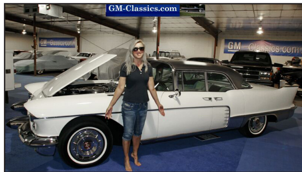
Won First Place Open Class