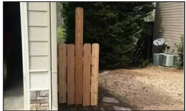
HOA of a 55 and older community told this guy he needs to cover his trash cans so they are not visible from the streets.