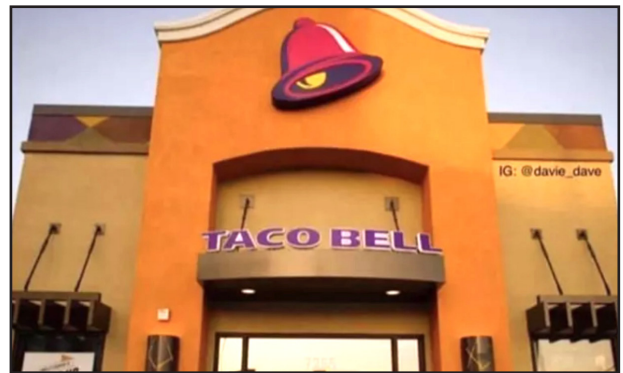
Cheapest gas in California right now.